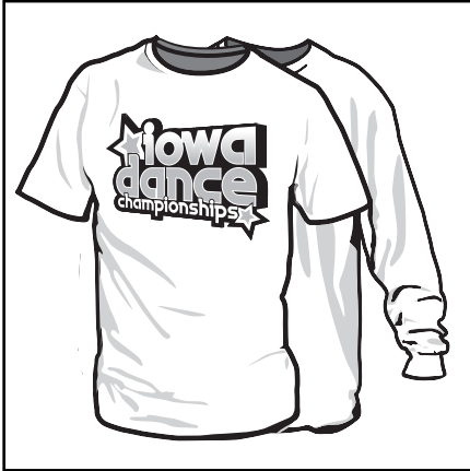
Front Design School Listing On Back

All of these shirts will have the 2012 Contest Logo printed on them. 2012 Contest logo is shown on the front of the handbook also but the shirt is available in white and black (short and long sleeve).